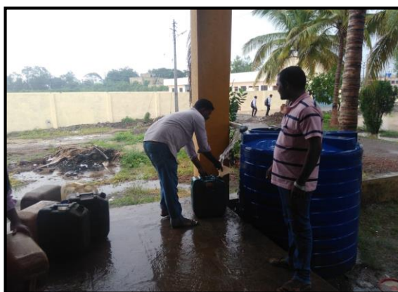
Collection of water harvested from rain water harvesting plant of chemistry department roof.