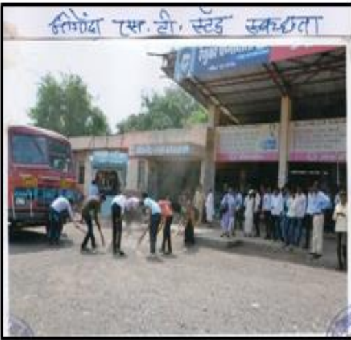
Cleanliness drive at Shrigonda Bus stand.