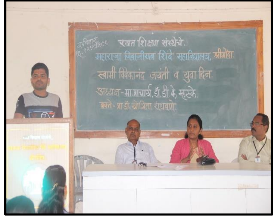
Student proposing vote of thaanks.