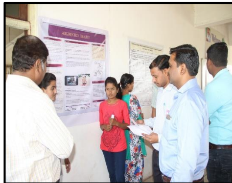
Students explaining their poster and papers to examiners.