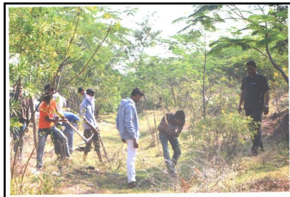
Tree plantation Programme at Madhewadgaon.