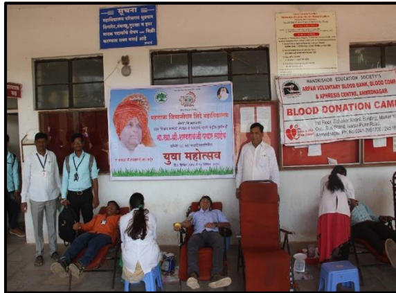
Students donating Blood in blood donation camp organized at college campus.