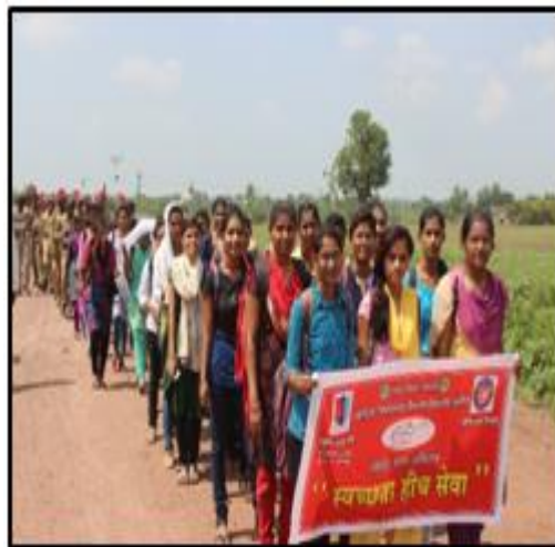
Swacchta rally to create awareness about cleanliness