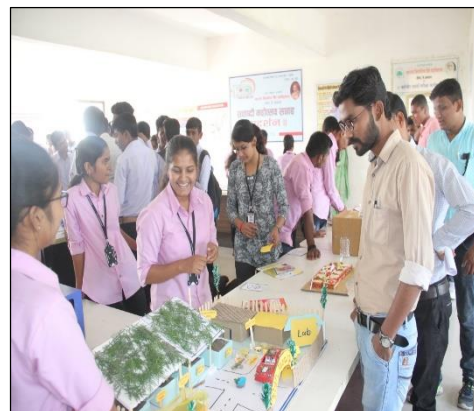
B.Sc. students explaining their science model in exhibition.