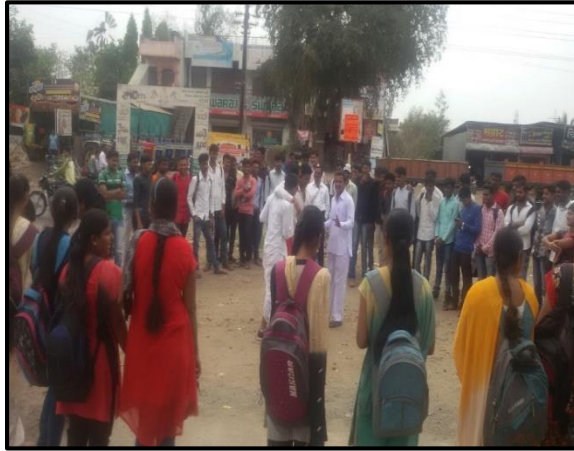
Students performing street play for “Beti Bachao- Beti Padhao”.