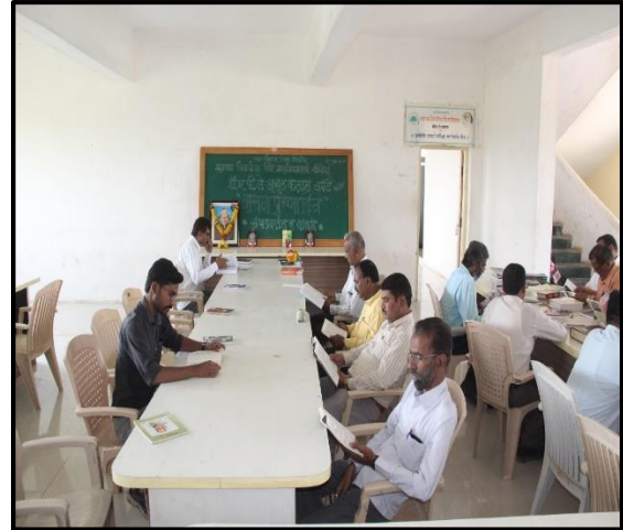
staff engaged in reading.